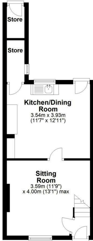
Ground Floor Approx. 32.1 sq. metres (345.1 sq. feet)